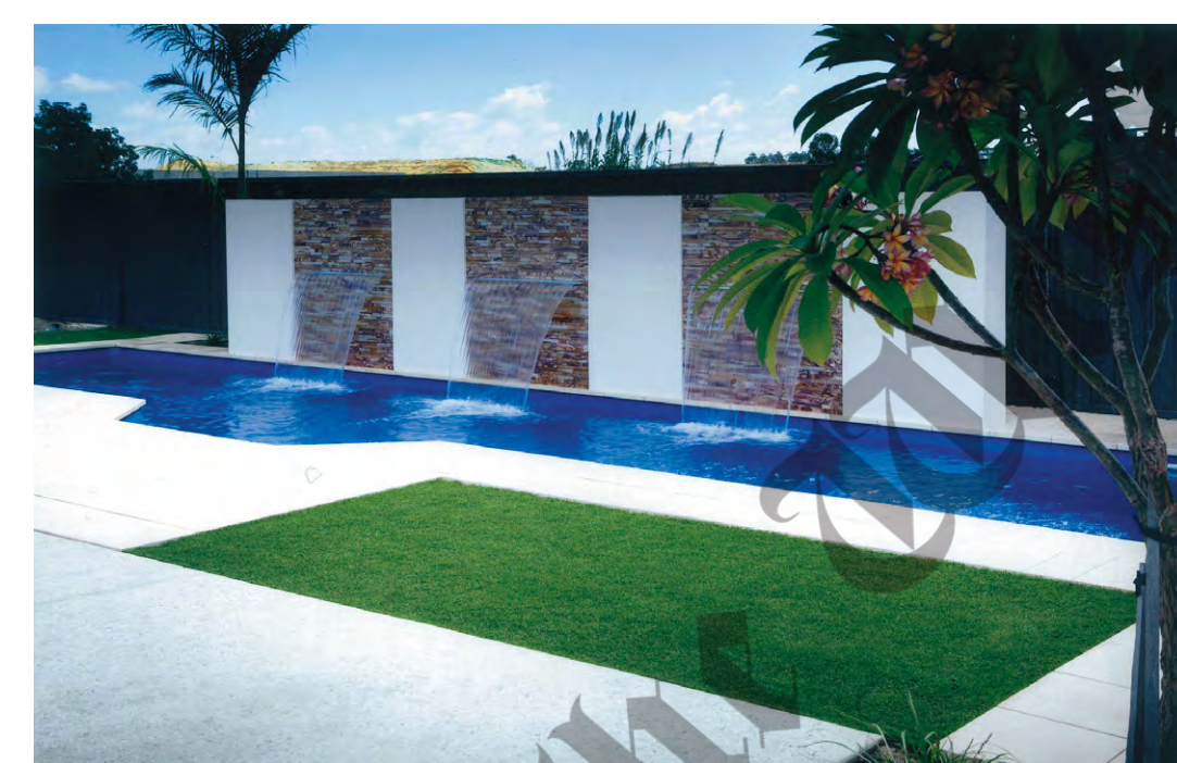
Barrier Reef Pools also won the bronze award for their display pools at a new sales centre in Wangara.

The silver award for the best display pool went to Exclusive Pools with an entry from a Signature Custom Homes display home in Attadale.