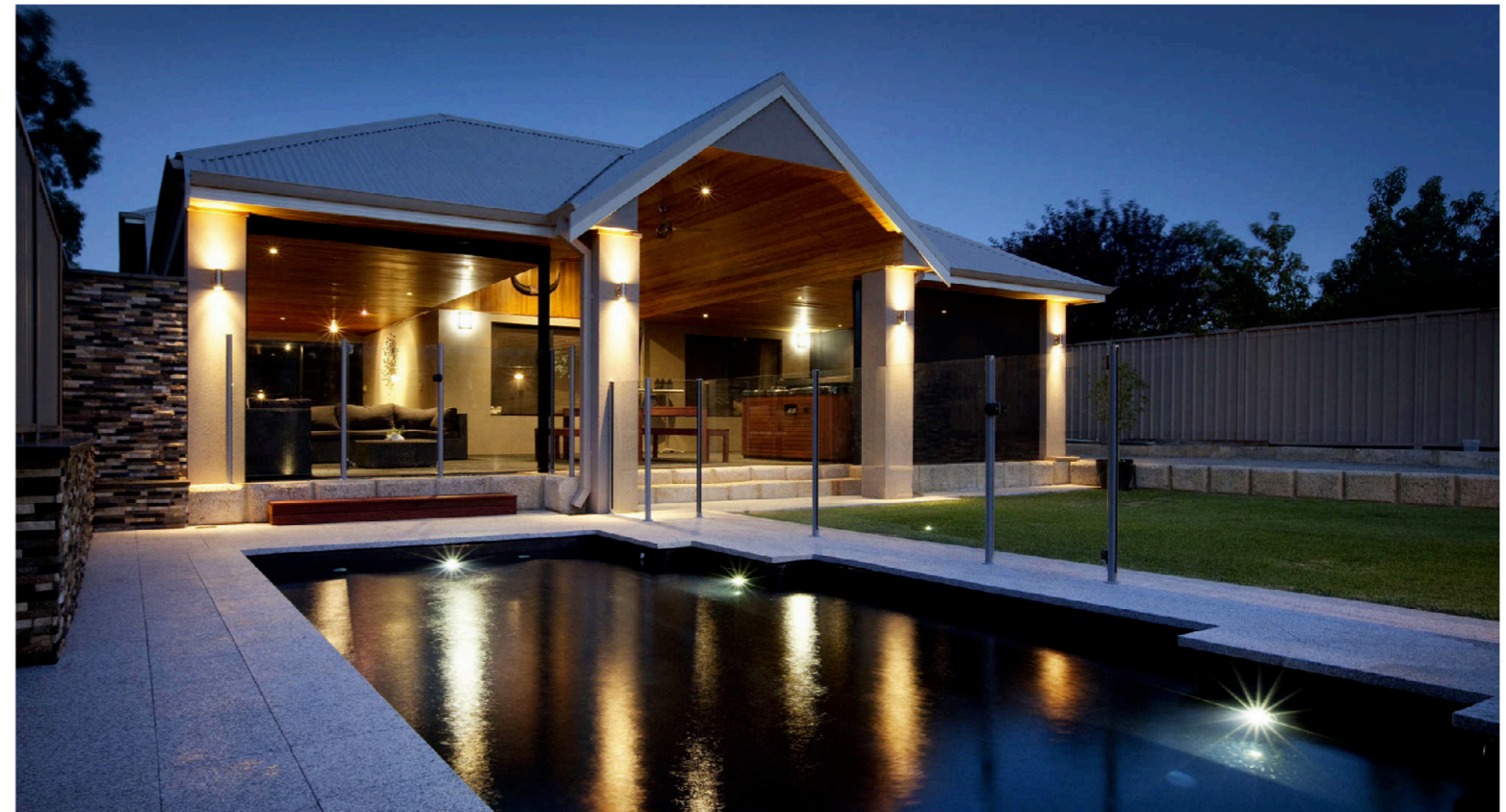
Barrier Reef Pools' use of concrete around the pool was a clincher for the family.