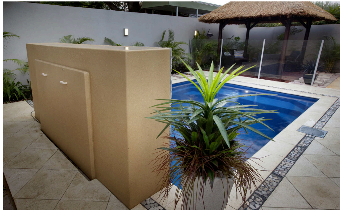
A Fremantle stone wall with a water blade adorns the pool area.

Post: The Editor, New Homes, The West Australian , GPO Box N1025, Perth WA 6843