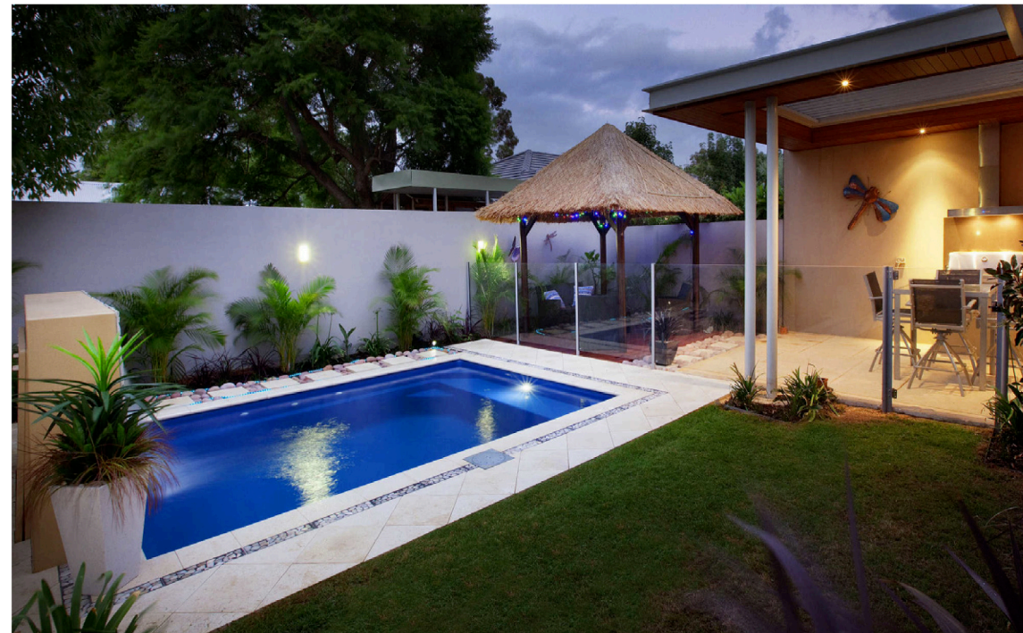
The new pool transforms the backyard of the three-year-old home.