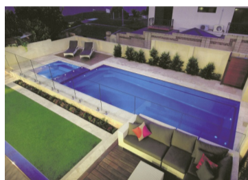
The sleek silver award-winner.