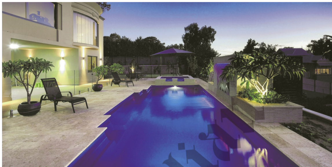
Barrier Reef Pools Northside took out the gold award with this resort-style design.

A water feature on one side has anodised metal cut-out flowers in a frangipani design with a remote-controlled and multi-coloured water blade.