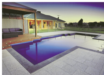
This rural design won bronze.

The spa can be separated from the main pool and heated in isolation by a Raypak gas heater or allowed to flow into the pool through two spillways.