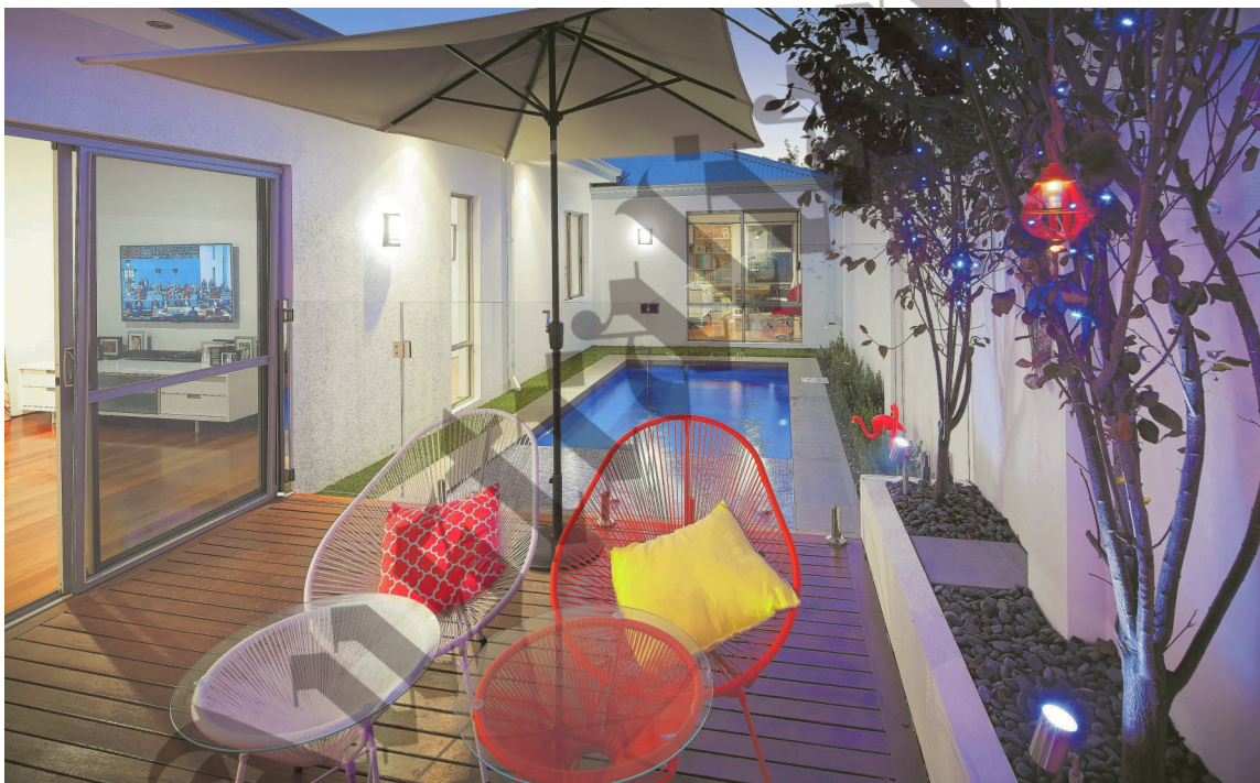
A slimline garden bed runs on the fence line, rising into an elevated line of trees in the decked area.