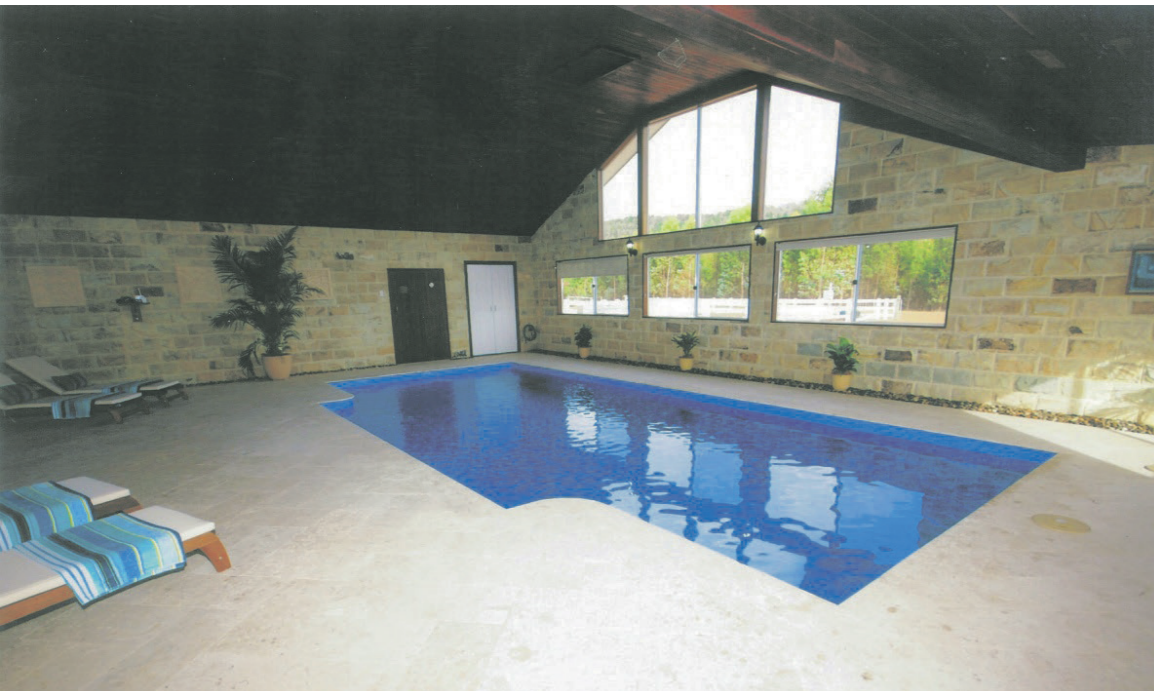
The Bunbury Pool Centre won the bronze award for indoor pools with this entry at Nannup.