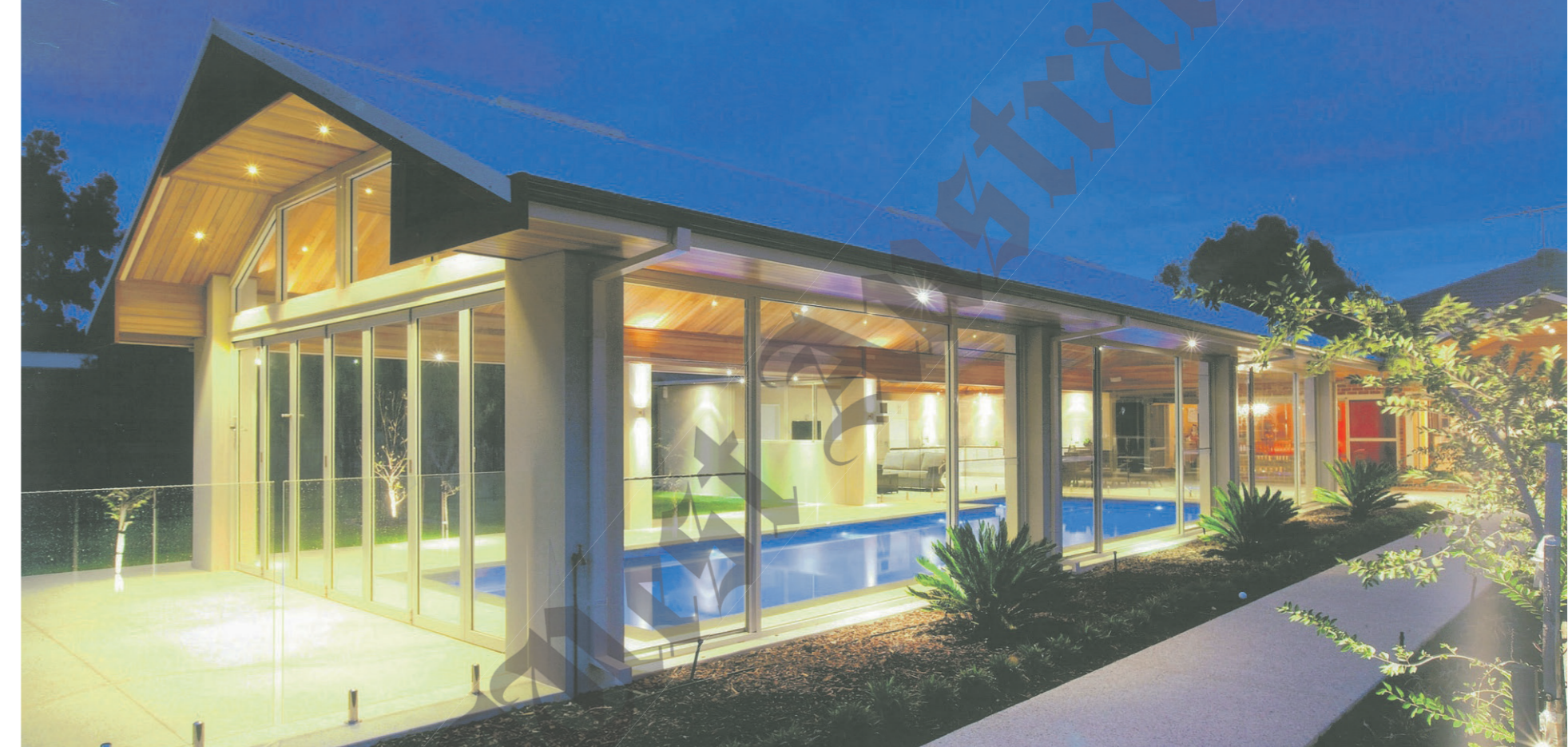
The gold winner by Quality Dolphin Pools included an extension to the house. The 12m x 5m pool has two skimmer boxes and is plastered in rainbow quartz in Hawaii blue with a granite header.