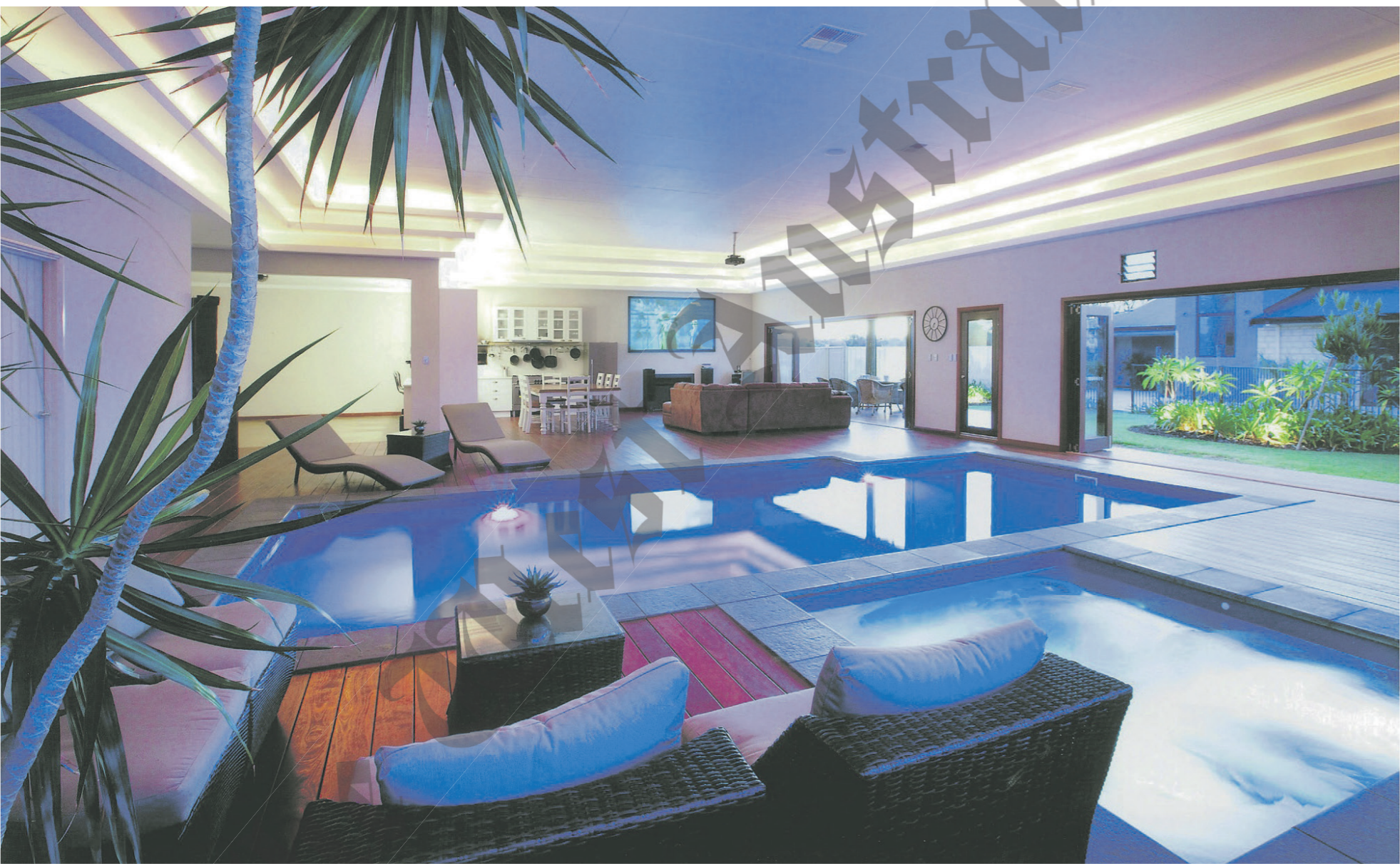
Barrier Reef Pools won the silver award for this South Yunderup pool.