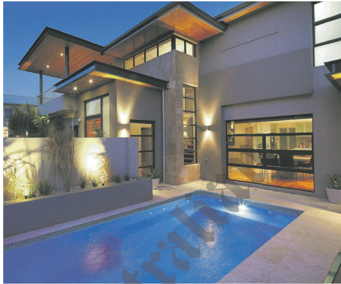
A Barrier Reef Monaco 6.2m by 2.8m pool extends down one side of the home's space.

Post: The Editor, New Homes, The West Australian , GPO Box N1025, Perth WA 6843