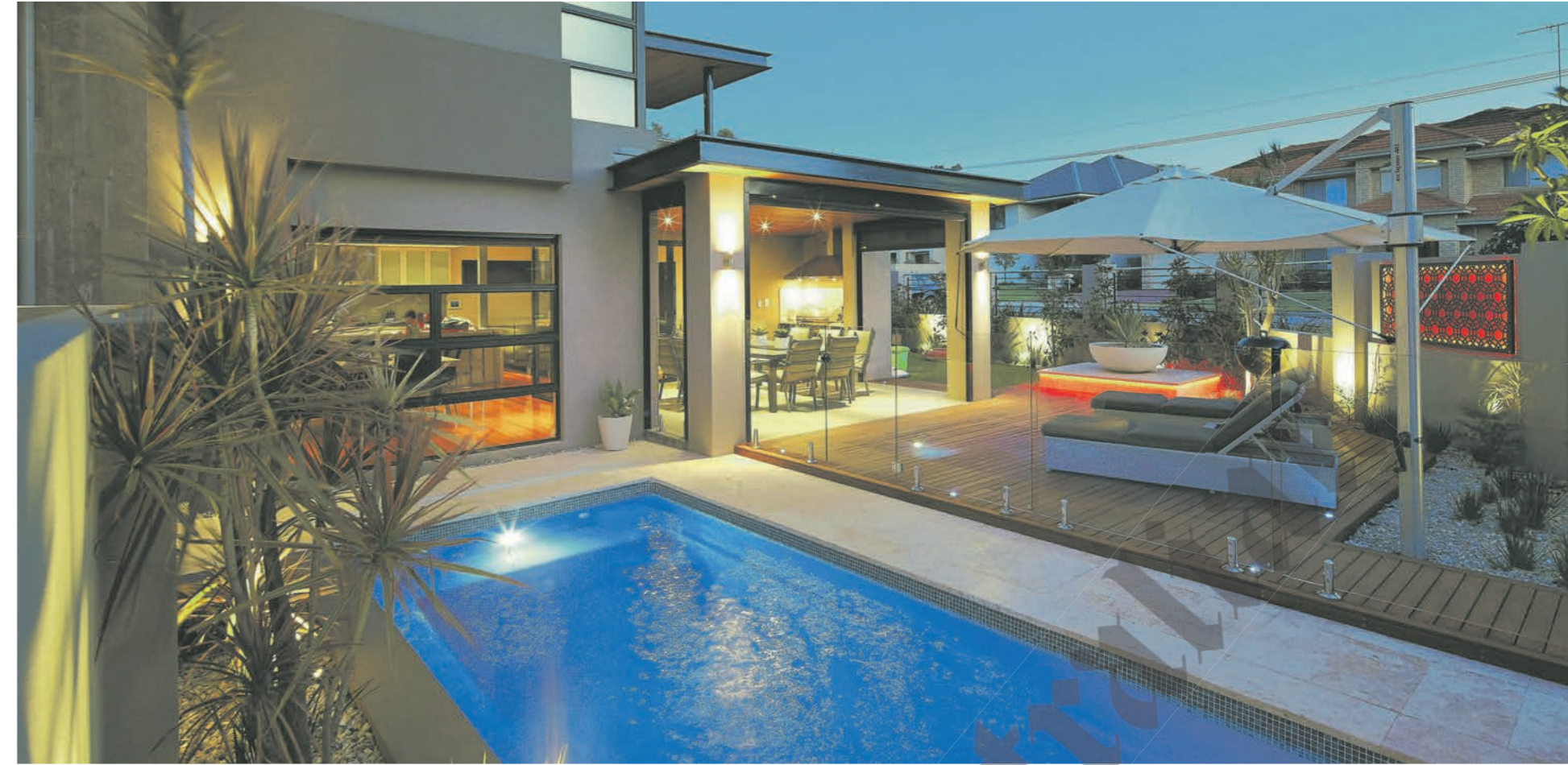
The pool is viewed through windows from all around the home.

A blanket box is barely visible in the stone but a practical install cleverly hidden out of the way, while frameless-glass fencing by Sorrento Glass Pool Fencing allows the pool area