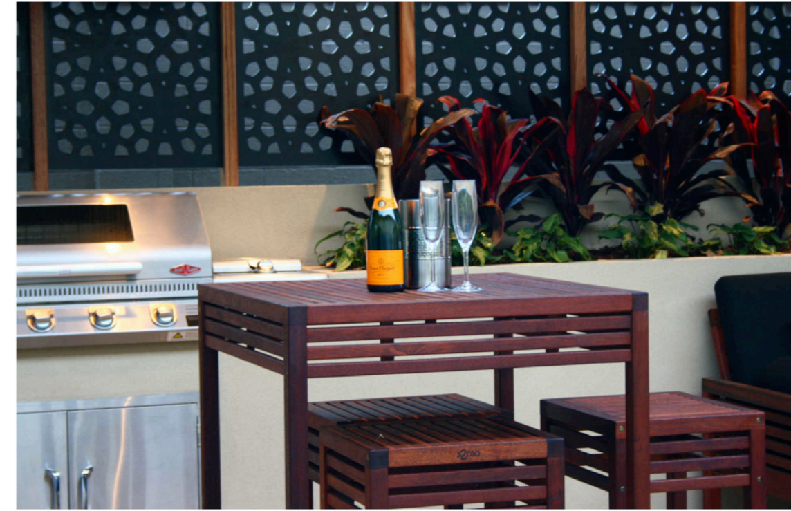
The screens look like weathered, rusted laser-cut steel but are made from fibre composite.