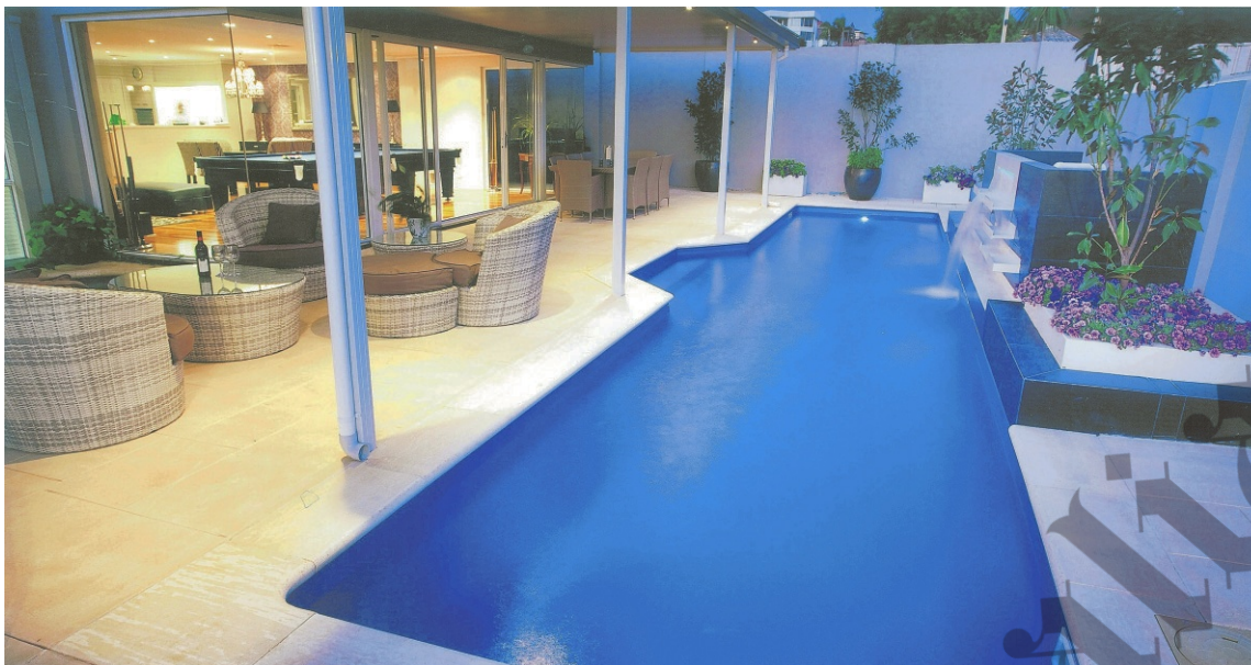
Barrier Reef Pools won gold for this residential fibreglass lap pool for a new home in Coogee.

Barrier Reef Pools won their silver award for a fibreglass lap pool on a corner block in Harrisdale. Exact engineering was required to locate this 12m pool so close to the boundary and landscaping around the pool area makes it an ideal entertainment area.