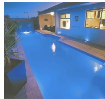
Barrier's silver award-winning pool at Harrisdale.

The 12m pool was installed across the back of the home with a stone clad water feature along one side adding to its appeal. Solar heating has been